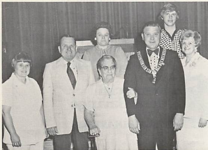
The Giebelhaus Family ↑