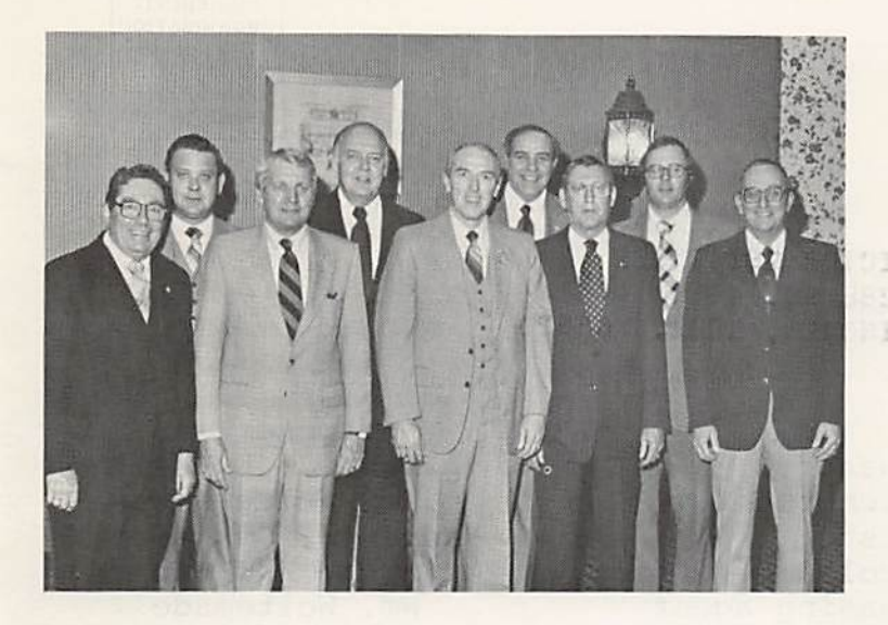
PER'S WHO PERFORMED INITIATION FOR FEBRUARY CLASS