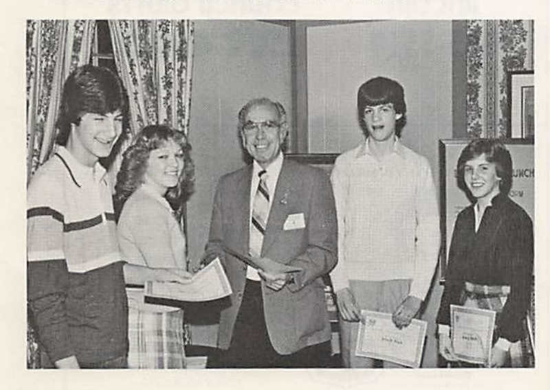
FEBRUARY TEENS OF THE MONTH

I would like to see #80 grow and flourish. To do that we all need to help. If everyone brought a brother to Lodge, we would double our attendance at the meetings. And, if one per cent of our members signed up a new member, we would reach our membership goal of 10% increase. Don't sit back and let someone else do it, do your part for #80. Thank you.