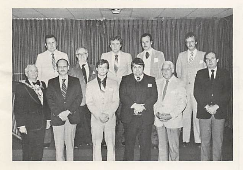
MARCH 1981 INITIATION CLASS