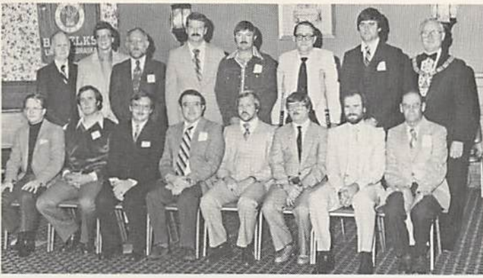
SEPTEMBER 1981 INITIATION CLASS