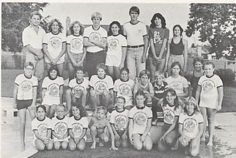
1981 LINCOLN ELKS SWIM TEAM

LINCOLN ELKS #80 SWIM TEAM was honored at the Family Night on August 28th. They did well for the season, finishing 8th in the CITY REC program. Our younger kids did real well and though the team was handicapped by not having enough older swimmers we look forward to real development and improvement next year. WE "SALUTE AND CONGRATULATE" all Swim Team members, their parents and Elks Lodge #80.