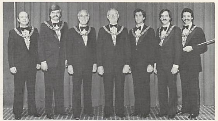
1981 LINCOLN ELKS #80 OFFICERS