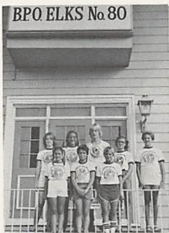
MY MEMBERSHIP CARD IN THE ELKS

I hold in my hand a little scrap of paper, two by three inches in size. It is of no intrinsic worth, not a bond, check or receipt for values, yet it is my most priceless possession. It is my membership card in the Benevolent and Protective Order of Elks of the United States of America.