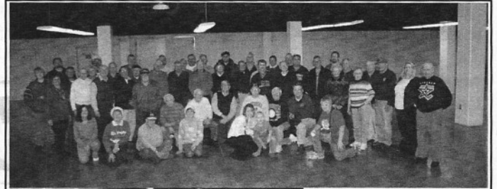
Thank you to those who helped at the Sacking Party on December 14th.