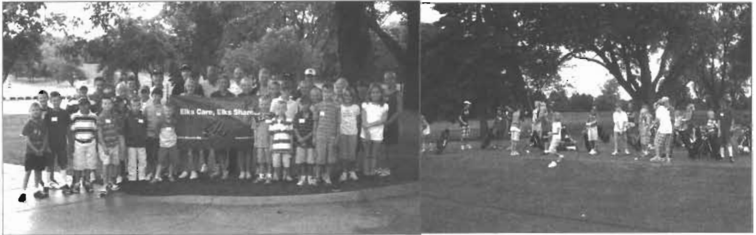
Photos above were taken on July 8th at the Youth Golf "Elks Pitch and Putt Contest"