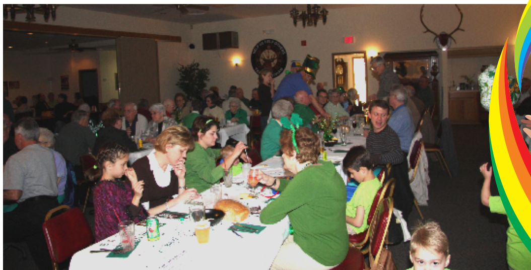
Fun was had by all that attended the St. Patrick's Dinner on Saturday, March 14