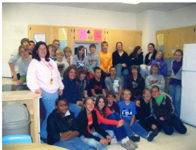
Pound Middle School – 8 th Grade FCS Class