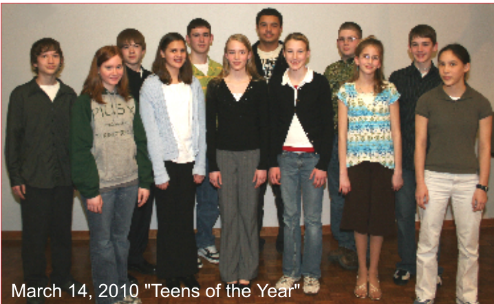
March 14, 2010 "Teens of the Year"

Your whole-hearted efforts toward making this Program a success will reap untold dividends for your Lodge, community, Order of Elks and our nation. Please mark your calendars for our next two "Teen of the Year" events at the Lodge; April 11th and April 18th at 2:00 PM.