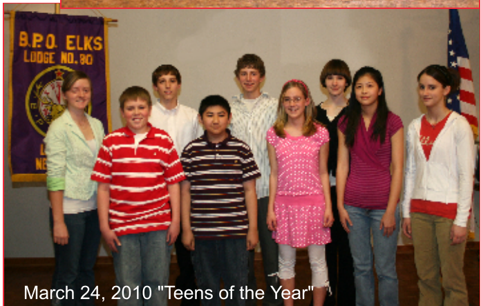
March 24, 2010 "Teens of the Year"