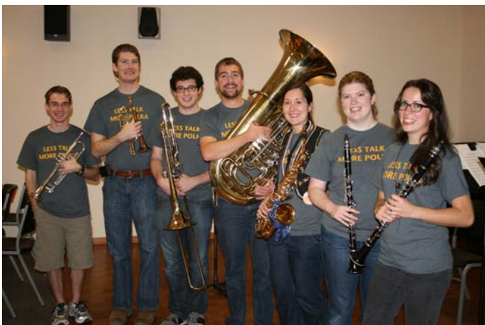
Members of the Less Talk More Polka band take a picture break during the November Oktoberfest Dinner.