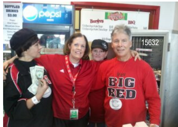
Elks and Does volunteering at the Nebraska Football stadium concessions