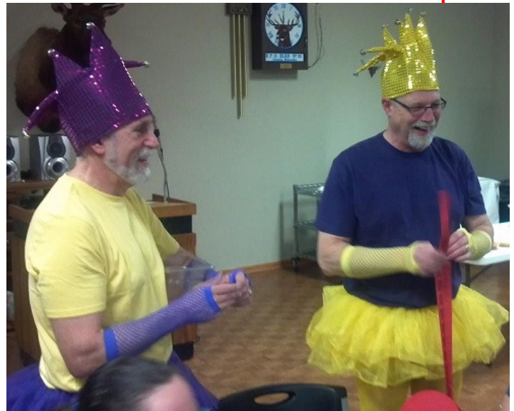
The Larry's strutting their faaaaaabulous stuff!