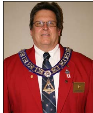
Exalted Ruler Lodge No. 80 2015-2016