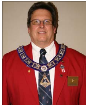
Exalted Ruler Lodge No. 80 2015-2016

A strong Elks National Foundation perspective in your Lodge is another means of helping develop an even greater "Elks Pride" among your membership. The per capita ENF goal for 2015-2016 is $4.65 per member, and I ask that each Lodge and every Member renew your commitment to support the Foundation. I have no doubt that you and I can exceed this goal, knowing that the ongoing benefits to be derived from our contributions will far exceed the value of our gifts, proving once again that "Care – Share."