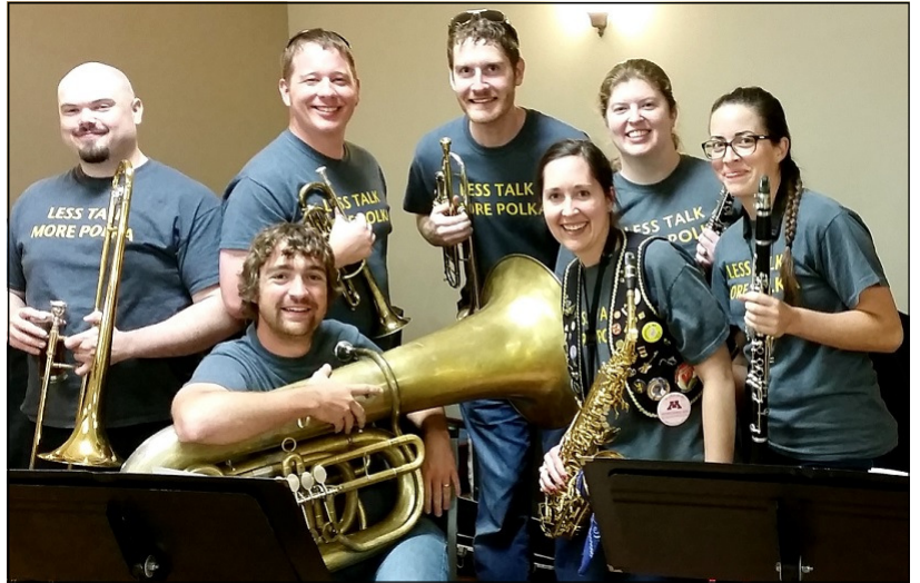
The Less Talk, More Polka Band Members: