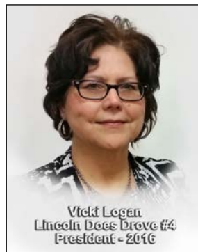
President Drove No. 4 2016

We need to promote our lodge more to our friends and family. Ask a friend or coworker to join, bring them out to a dinner to let them see what they are missing.