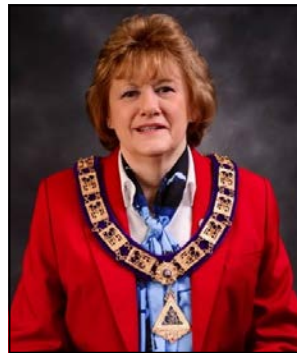
Exalted Ruler Lodge No. 80 2016-2017

Orientation is the most important Committee in your Lodge for the development of a long-term, active Member. Please begin thinking of Orientation as the "First Step in Member Retention" and make it a "process" that begins with the application and does not end until you get the new Member back into the Lodge for his or her very first Lodge activity, program or event. Only then have you made the connection and created a real sense of belonging that causes the new Member to understand and appreciate what a gift we have in Elkdom.