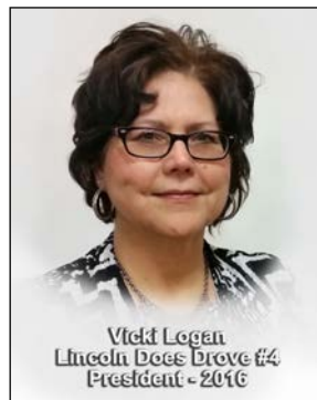
President Drove No. 4 2016