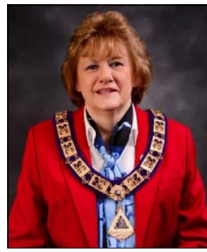
Exalted Ruler Lodge No. 80 2016-2017