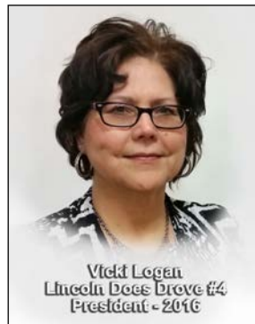
President Drove No. 4 13214