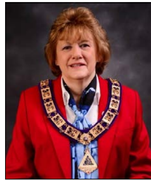
Exalted Ruler Lodge No. 80 2016-2017

Thank you for being an Elk and for Caring and Sharing.