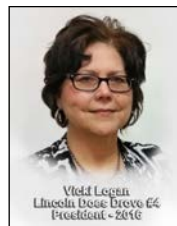
President Drove No. 4