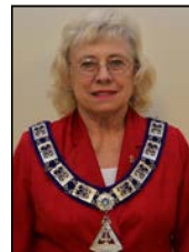
President Drove No. 4