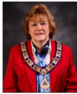
Exalted Ruler Lodge No. 80 2016-2017

Finally, thank you for being an Elk, and for Caring and Sharing.