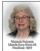
President Drove No. 4