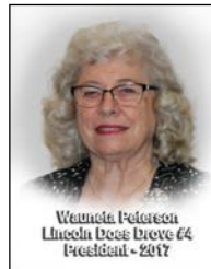
President Drove No. 4