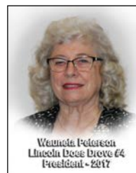
President Drove No. 4

Summer months are filled with fun and busy-ness. Stop in at your Lodge for a cool break! We are serving lunch and light dinner, and our gracious bartenders will be happy to help you. See you around the Lodge!