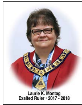
Exalted Ruler Lodge No. 80 2017-2018

Thank you for Caring and Sharing and for continuing to demonstrate that, "Elks are Leading the Way."