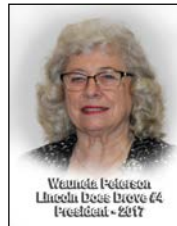
President Drove No. 4