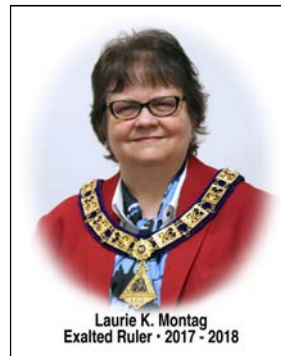
Exalted Ruler Lodge No. 80 2017-2018

With these practices in place, your Lodge will be set up for success, as we have in the past 150 years, to respond to the needs of your community and ultimately fulfill your organization's goals.