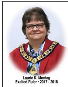
Exalted Ruler Lodge No. 80 2017-2018