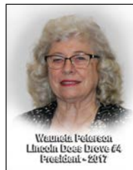
President Drove No. 4

See you around the lodge - and Go Big Red!