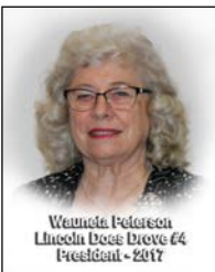
President Drove No. 4