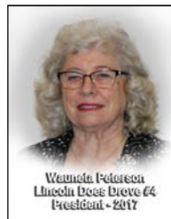
President Drove No. 4