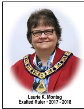
Exalted Ruler Lodge No. 80 2017-2018

Please, if you have any questions or comments of how I can better serve you, please contact me. My phone number is 402-570-2555 and my email is: lodge80secy@yahoo.com. See you all around the lodge.