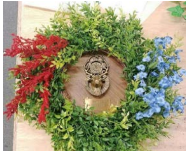
Elks Memorial Wreath