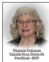
President Drove No. 4

As always go to the dinners, stay active and just have fun!