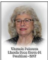
President Drove No. 4

I'll see you in San Antonio next month for my last moments as your Grand Exalted Ruler. I'm looking forward to celebrating all that we have accomplished this year and welcoming a new year of leadership to Elksdom.