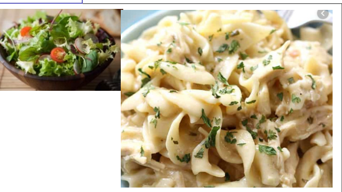
Noodle Day - Wednesday Chicken and Noodles, Salad, Bread

Sloppy Day - Tuesday Sloppy Joe Sandwich, Chips, Salad