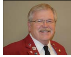
Exalted Ruler Lodge No. 80 2021-2022

Start the new Lodge year with a pro-active mindset.