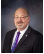
Grand Exalted Ruler, 2021-2022