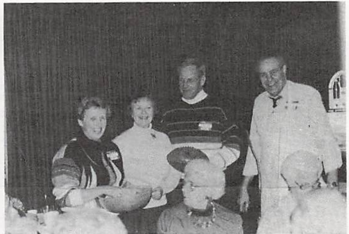
Great Door Prizes