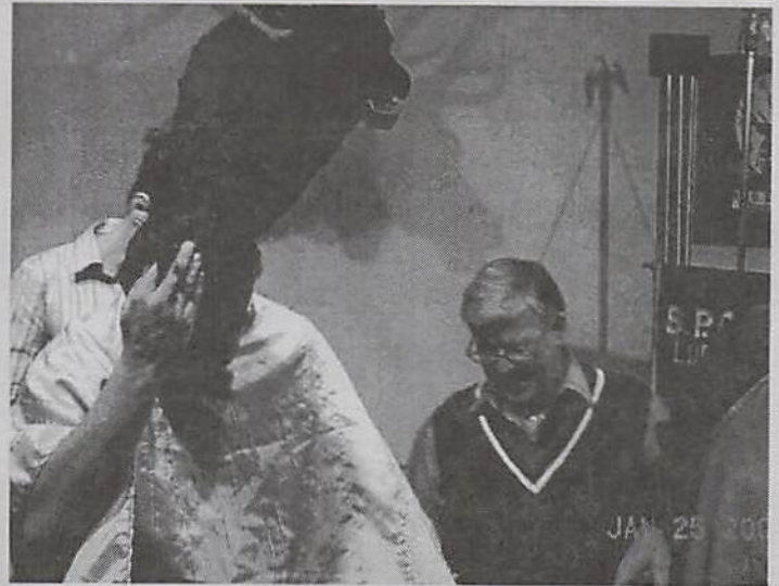
The auctioneer is having a good time, even the elk on the wall seems to be enjoying the event.