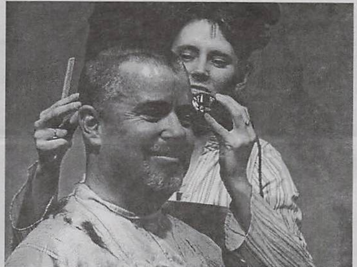
Nearing the completion...