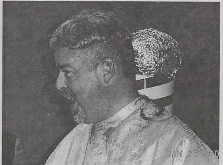
The ER's father provided a wig to protect his son's head during these cold January days.