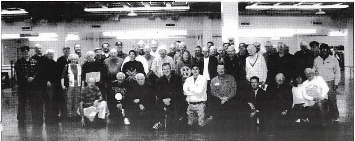
2005 SACKING PARTY VOLUNTEERS