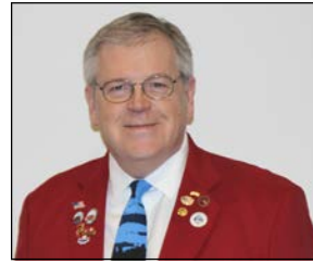
Exalted Ruler Lodge No. 80 2019-2020